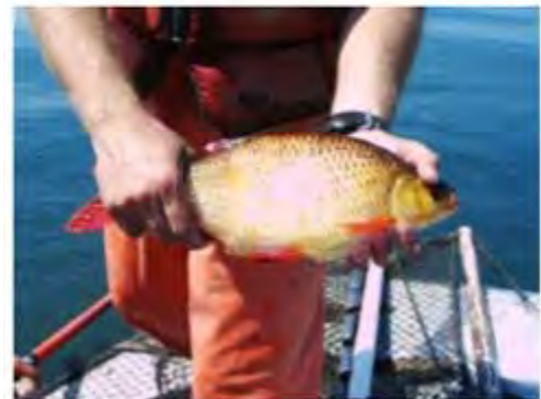
The rudd is a large non-native minnow species that is abundant in the Niagara River.